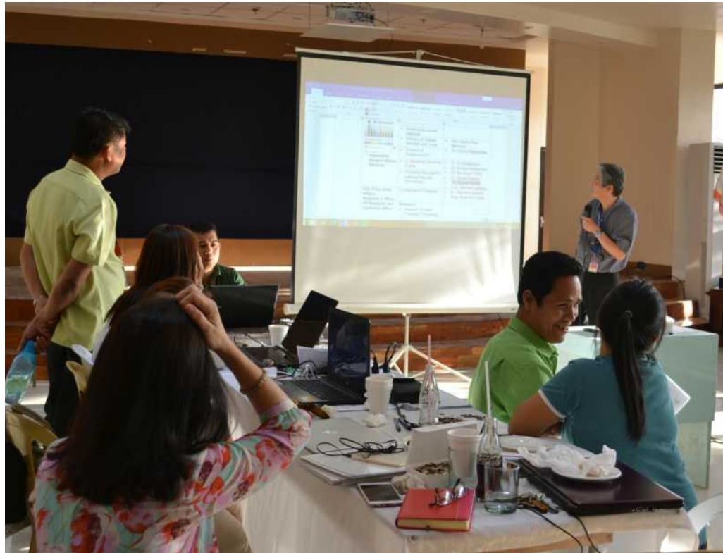
University officials and process owners listen to a DAP consultant discuss on QMS implementation during the "Technical Guidance on QMS Implementation" last September 24-28.

The Development Academy of the Philippines (DAP), together with the university internal quality auditors, will make rounds on selected offices as part of the series of ISO internal audits. The mock audits are part of the DAP technical guidance to train university internal auditors on auditing quality management system until the official certification survey by external auditors. The offices to be audited include the Research Services, Extension Services, Guidance Office, Registrar Office, Dean Offices, among others. The activities are facilitated by the NWSSU Quality Management System (QMS) Core team.