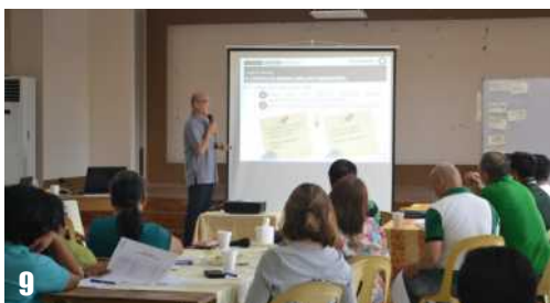
1) Streamlining Frontline Services Seminar; 2) ISO 9005:2015 Orientation Seminar; 3) Technical Guidance on Review and Enhancement of Operational Controls and Procedures; 4) Training course on auditing QMS ; 5) Mock audit at REEA; 6) Records Management Orientation; 7) Readiness Assessment at San Jorge Campus; 8) Root cause analysis and corrective actions; 9) QMS Documentation; and 10) Workshop on 5s Good Housekeeping.